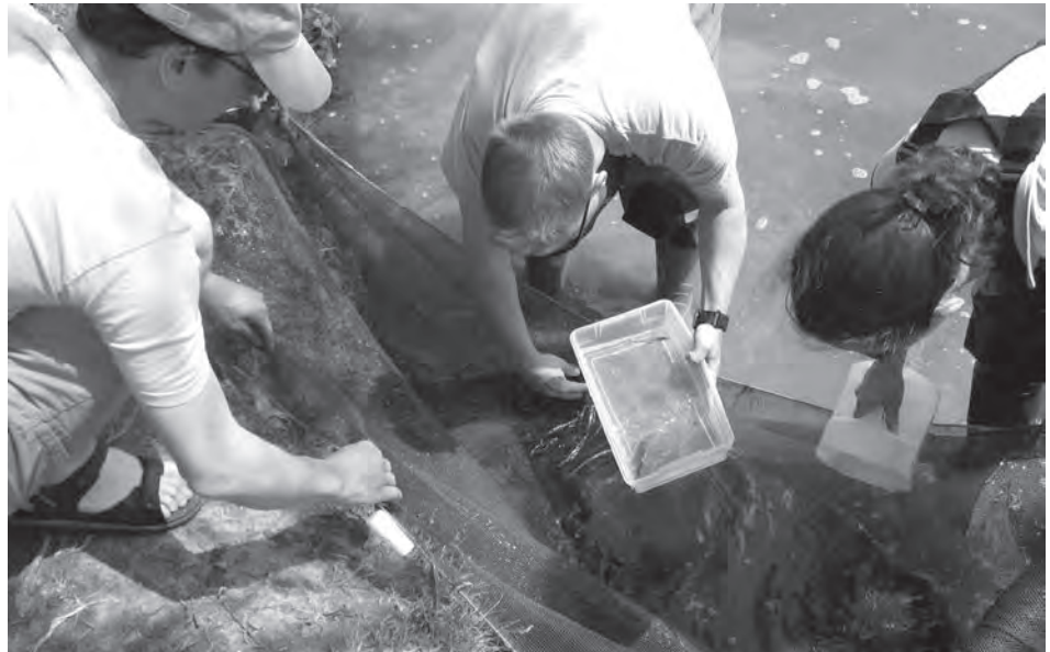
Students in the watershed course get hands-on experience.

The course is possible because of a grant from the David S. Bourne Foundation, which the Friends of Lake Wingra received to educate the community about the watershed.