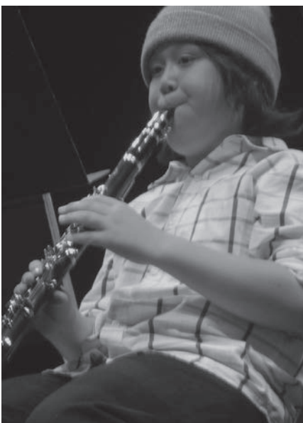
Playing in the Spring Concert