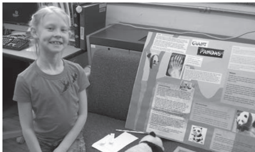
A Lake student presents her independent project on pandas.