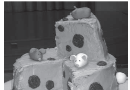
One of the creative cakes at the cake auction