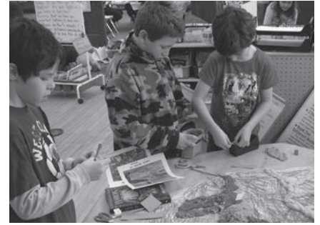
Building a 3-dimensional map of Hawaii