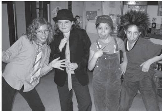
All dressed up for Kids' Night Out