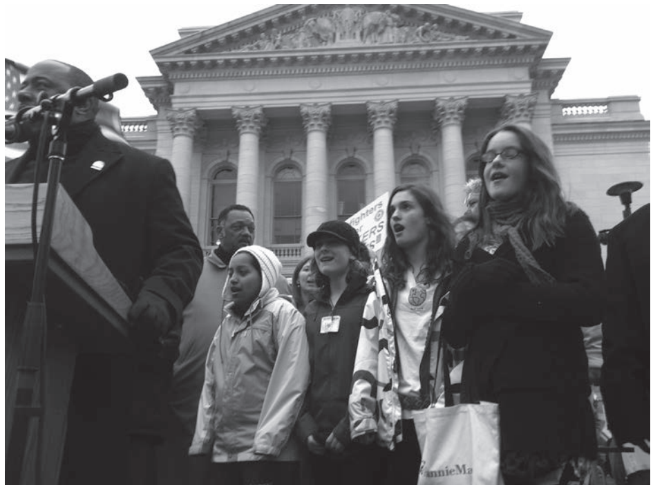
Sky students stand on stage with Rev. Jesse Jackson during a rally at the Wisconsin State Capitol in April 2011.

We expect students to be active participants in their learning—to take ownership of it—and to work to make Wingra and the larger world an even better place to learn and live.