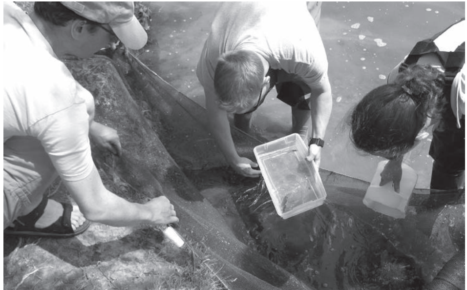
Students in the watershed course get hands-on experience.

The course is possible because of a grant from the David S. Bourne Foundation, which the Friends of Lake Wingra received to educate the community about the watershed.